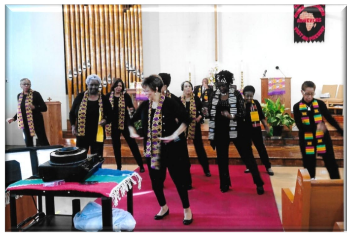
JOY (Just Older Youth) Senior Adult Ministry Zion Hill Baptist Church