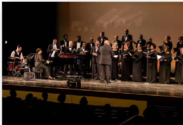
Uzee Brown Society of Chorliers