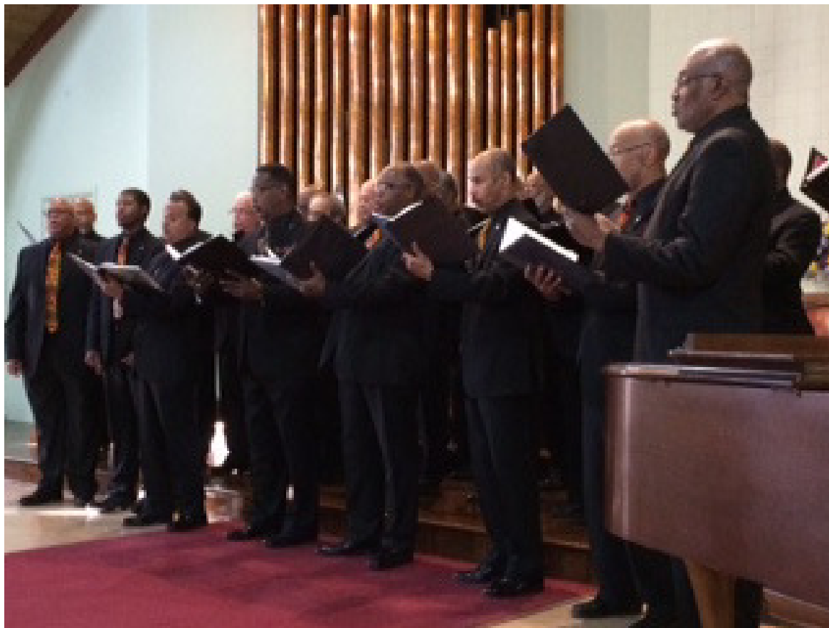
The Joseph L. Roberts Jr. Men's Chorus