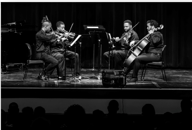
1Tufton Tet String Quartet