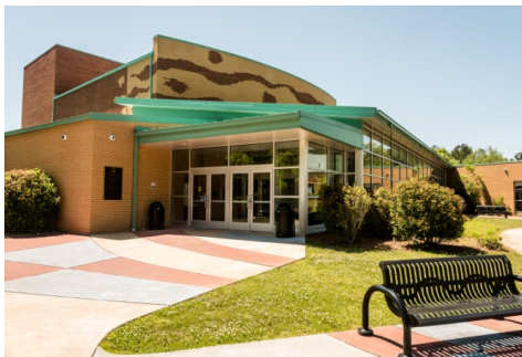
Southwest Arts Center Performance Theater Atlanta Georgia

Southwest Arts Center Performance Theater 915 New Hope Road Atlanta, Georgia 30331